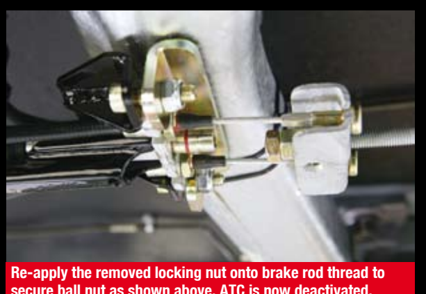
secure ball nut as shown above. ATC is now deactivated