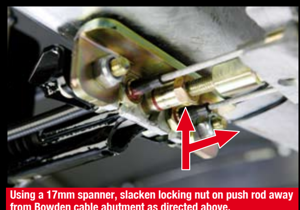
from Bowden cable abutment as directed above.