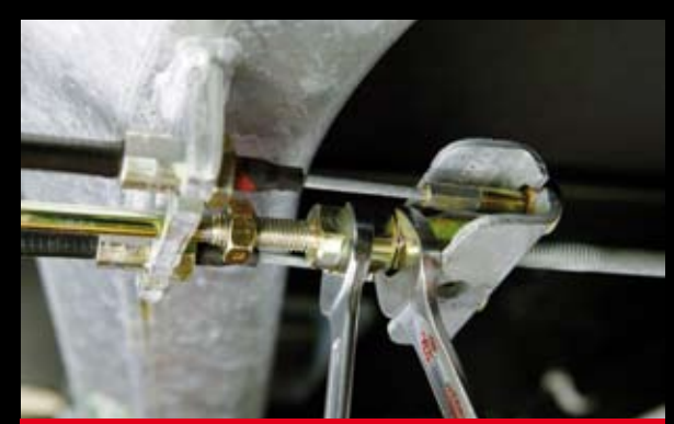
Unscrew push rod from brake rod and slide it from the quide tube. Remove the locking nut from push rod using two 17mm spanners.