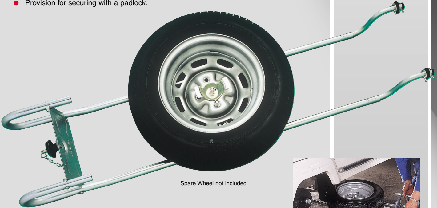
Spare Wheel not included